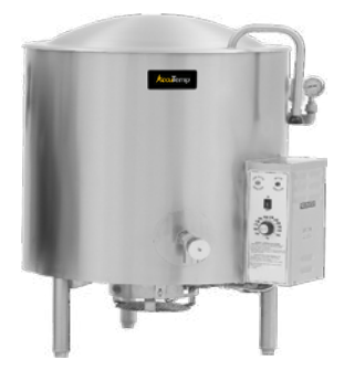
EDGE<sup>TM</sup> SERIES KETTLE 2/3 & full jacketed stationary & tilting kettles.

EDGE<sup>TM</sup> SERIES TILT SKILLET 13, 30, or 40 gallon capacities with a variety of tilt and accessory options.