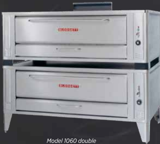
Model 1060 double