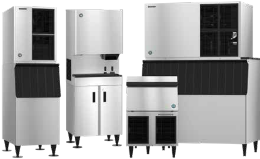
KM-520MAH on B-300