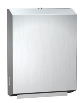
TD-B Wall/Backsplash Mounted Towel Dispenser. Holds (525) Multi-Fold or (400) C-Fold Paper Towels. Includes Lock & Key.

> Overall Size: 11" x 14%" x 4<sup>1</sup>/<sub>16</sub>"