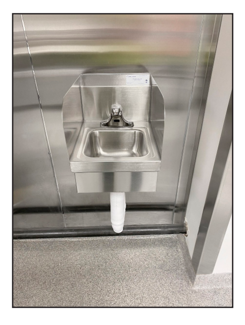
Model #CSW w/ Side Splashes & EFD-2D Electronic Faucet