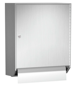
TD-AR Wall Mounted Automatic Towel Dispenser. No-Touch Roll Up to 800ft. Includes Lock & Key.