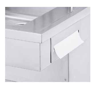
ITD Integrated Towel Dispenser Built Into Apron Of Hand Sink.