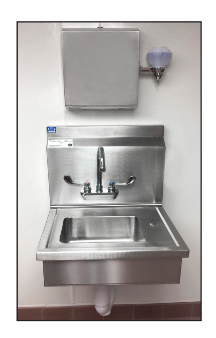
Model #WS-2S w/ CTSD