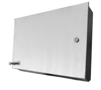
Integrated Combination Towel Soap & Towel Dispenser, Unit & Soap Dispenser, Unit To Be Wall Mounted Above IMC/ Teddy Hand Sink. Includes Lock & Key.