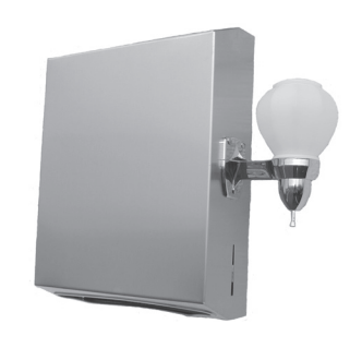
CTSD Wall Mounted Combination Towel & Soap Dispenser.

Unit. Holds (1) 8" Wide Towel Includes Lock & Key.