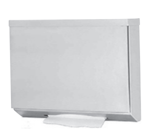
TD Wall/Backsplash Mounted Towel Dispenser.