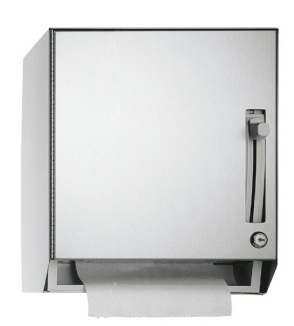
TD-R Wall Mounted Roll Towel Dispenser. Holds (1) 8" or 9" Wide Towel Roll Up to 800 ft. Includes Lock & Key.

> Use w/ Any Sink >> Overall Size: 11" x 8" x 4"