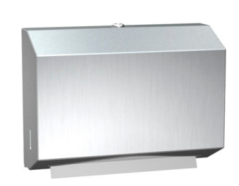
TD-L Wall/Backsplash Mounted Mini Towel Dispenser. Holds (275) Multi-Fold or (200) C-Fold Paper Towels. Includes Lock & Key.

> Overall Size: 11" x 14%" x 4<sup>1</sup>/<sub>16</sub>"