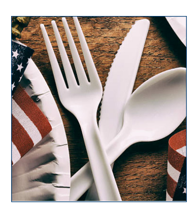
True Count Cutlery