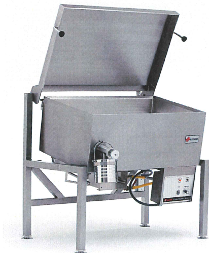
Model CSG41-9 Insulated Combi-Pan® Tilting Skillet Shown with optional can holder