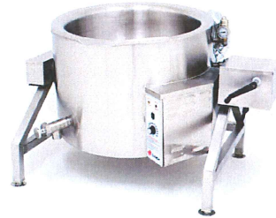
Model TLGB-40F Insulated Low Rim™ Tilting Gas Fired Kettle