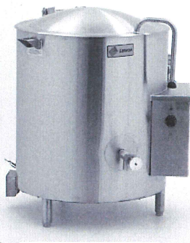
Model LEC-60 Insulated Electric Kettle