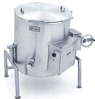
Model TWE-60 Insulated Tilting Electric Kettle Shown with optional draw-off valve