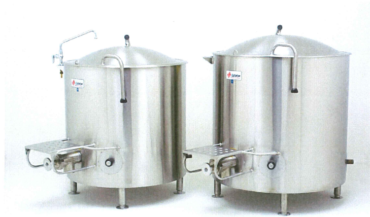
Models LTI-60 and LTI-80 Insulated Direct Steam Kettles Shown with optional Prison/Security Packages & Faucets