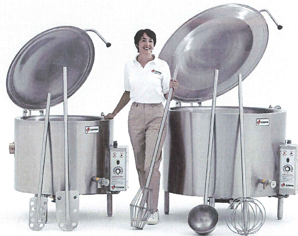
Model LGB-40F Insulated Low Rim™ Gas Fired Kettle