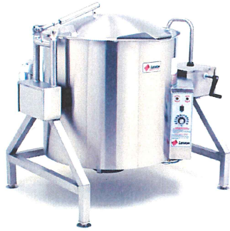
Model TLGB-60 Insulated Tilting Gas Fired Kettle