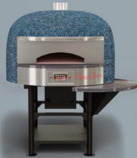
the ELECTRIC (Neapolitan Design)