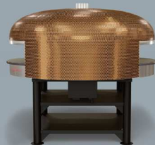
PASS-THRU (Due Bocche Oven)