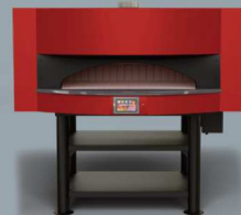
MS SERIES (Space Efficiency)