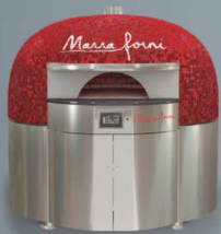
the ROTATOR (High Production)

Marra Forni has many test kitchens located throughout North America, Canada, the Middle East, and Latin America. You can take your next authentic Italian wood, gas, or electric brick oven for a test drive anytime.