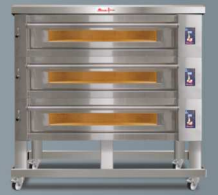
EL SERIES (Electric Stackable)