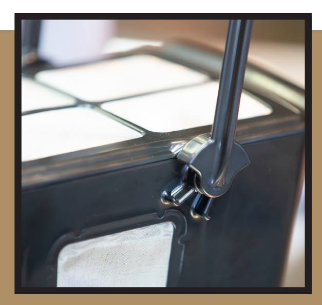
Sucure cam lock handles