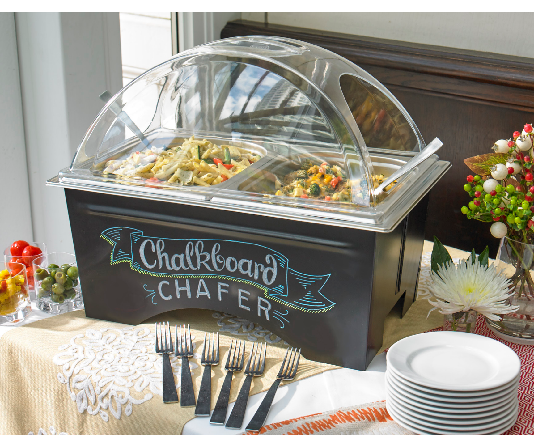
Learn more about our full line of catering equipment at Sterno.com