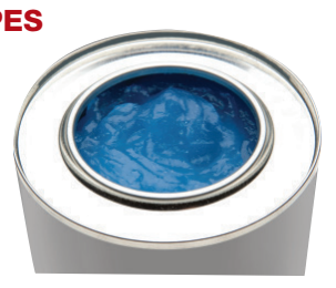
Methanol Blend Moderate Heat