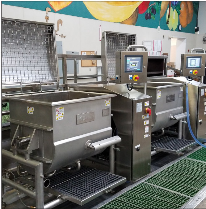
Two 100-Gallon Stationary Cooking Vessels

The TUCS STATIONARY COOKING VESSEL is a low rim height, trough-shaped vessel with a horizontal mixing scraper agitator for the production of liquid, semi-viscous and viscous products (soups, sauces, stews, mashed potatoes, refried beans, etc.). This agitator lifts the heavy particulate off the bottom and moves it to the top while pulling the floating particulate to the bottom, in a gentle mixing, folding action. The vessel has a 3" air-operated, flush-mounted drop-down valve for the attachment to a Tucs volumetric piston pump or other pumping devices. Pre-piped for single point attachment to utilities and a complete integrated digital control panel with a pendant mounted digital HMI.